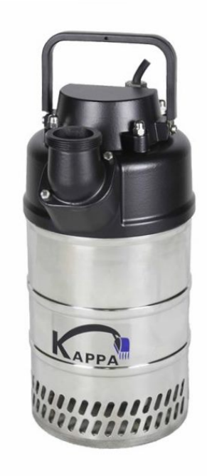
Attention: pictures for illustrative purposes

Installation: Vertical Floating on board machine: not present